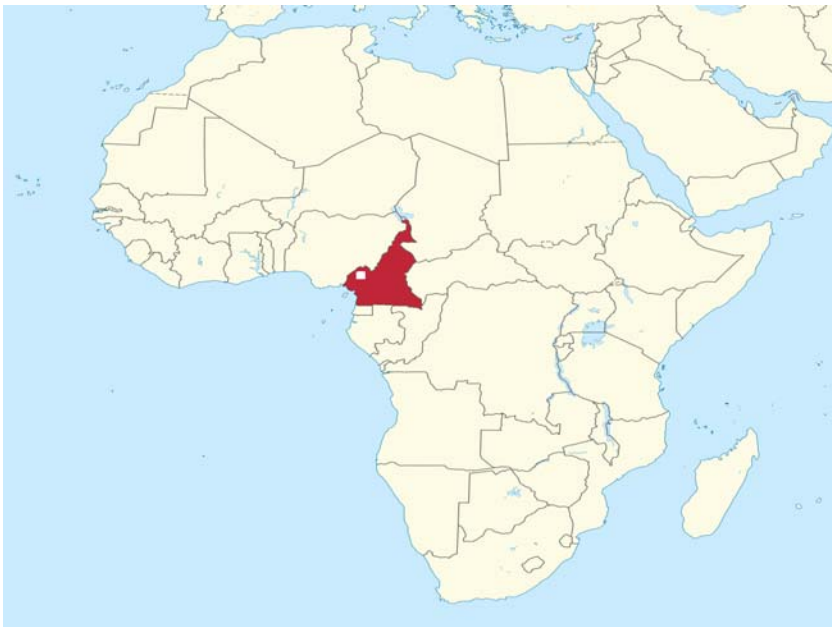
Figure 1. Map illustrating study area in Cameroon. Adapted from the Map of Africa, Google.

The Aghem are in the present day Menchum Division of the North West Region of Cameroon. They are bounded to the north and northwest by the Esu and Weh, to the West by the Kuk, south and southwest by the Beba, Befang, and Esimbi settlements (see figure I and II for the location of the study area).