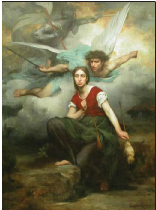
Figure 1. Jeanne d'Arc , by Eugène Thirion (1876). The portrait depicts Joan of Arc's awe upon receiving a vision from the Archangel Michael.

Joan's fame came when she claimed to hear the voice of God, which instructed her to expel the English and to have the Dauphin, Charles Valois (Crown Prince of France) crowned king of France. Incredibly, Joan would get her chance to meet with the Dauphin Charles VII when the situation changed for the worse in 1429. In 1429, the city of Orléans, loyal to the French crown, had been under siege by the English for over a year. With