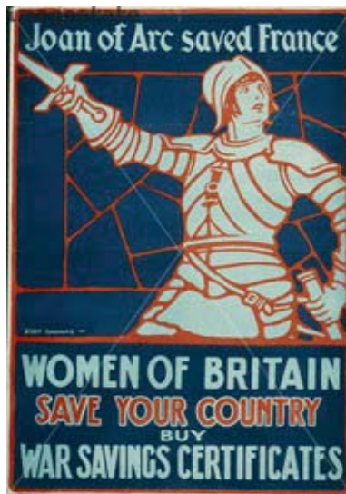
Figure 4. Joan of Arc , World War I British propaganda.

Perhaps nowhere is Joan of Arc more continually re-imagined than in popular culture. It is safe to say that Joan of Arc is a cultural phenomenon, a person