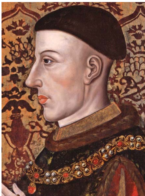
Figure 1. King Henry V, by unknown artist. Oil on panel, late sixteenth or early seventeenth century. National Portrait Gallery, UK.