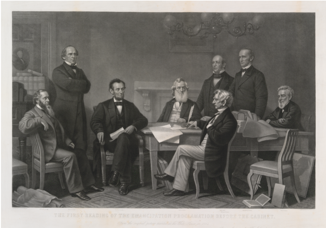
The First Reading of the Emancipation Proclamation before the Cabinet. [Alexander Hay Ritchie, artist. National Portrait Gallery, Smithsonian Institution; transfer from the National Gallery of Art; gift of Mrs. Chester E. King]

declared martial law in separate parts of the Confederacy, which led to an uneven application of civil liberties.