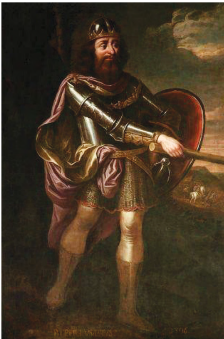
Robert the Bruce, King of Scots, circa 1684-1686, painted by Jacob de Wet II.

This passage of the arrival of the English vanguard near Torwood suggests a careful choosing of words by the author(s). This is so, in that there is no mention of the ill-conceived charging of the English knights against the Scots once they got sight of them. The author merely relays how the cavalry under Lord Clifford positioned his force in such a way as to prevent the Scots from escaping or to