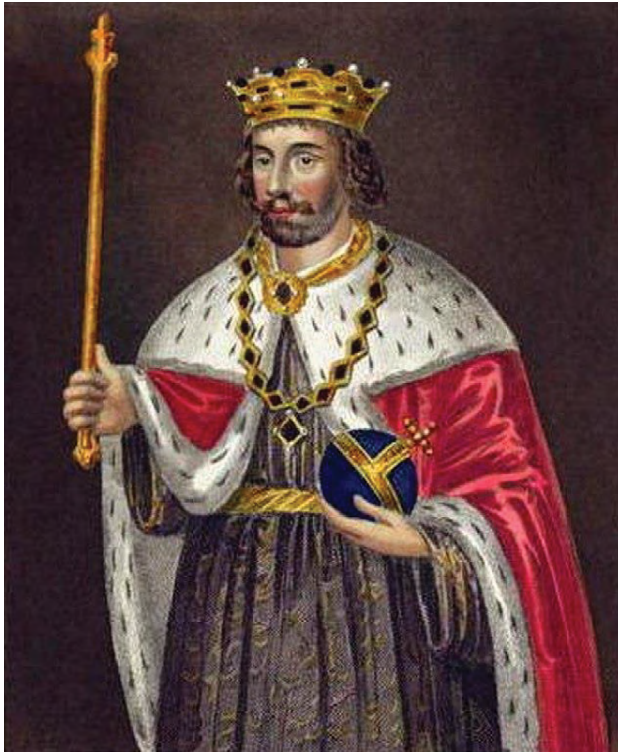
King Edward II of England, 19 th century.