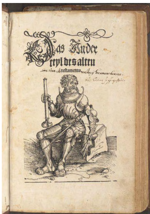
German Translation of the Old Testament https://www.loc.gov/item/00650809/

he was in fact defending the Church. There are also some other possibilities such as that he was trying to repair his relationship with the Pope as he had become overly aggressive. Another possibility was that he was attempting to address the Pope in a manner befitting his position as he had previously treated clergymen with very high respect. This can be seen three years prior in his initial letter to Archbishop Albretch. 21 However the letter also directs a large amount of criticism at Cardinal Cajetan and call his character into question.