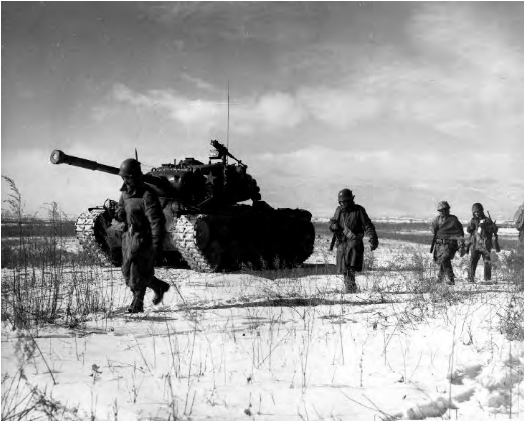
A column of the US First Marine Division move through Chinese lines, Battle of Chosin Reservoir.

form of deployment and convinced Almond to make some concessions. First, Colonel Allan MacLean split from the 7th Infantry Division and replace the 7th Marines in the east. The second concession was to allow the Marines to construct an airfield at Hagaru, which Almond only allowed because only Marines would perform the labor. The date was November 27, 1950 and the PVA forces were about to attack in force.