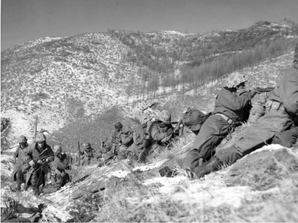
Marines talking cover at the Battle of Chosin Reservoir, Korean War.

withdrawn to Chinese territory. 10 To this end, Almond formulated a plan for the X Corps to move west into Yudami-ni, while the Army's 7th Infantry Division moved east to Sinhung-ni. The 3rd Infantry Division providing security along the western flank of the advancing task force became spread over 400 miles of front lines. The Americans, along with the ROK forces, had begun to envelope Lake Jangjin, which maps referred to by their Japanese pronunciation as the Chosin Reservoir. The PVA had also staged around the Chosin Reservoir with fifteen divisions of approximately 120,000 infantry. The stage was now set, with both sides seeking the complete destruction of the other, and