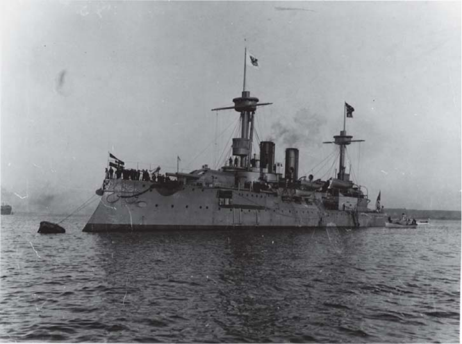
Figure 1. SMS Brandenburg , Imperial Germany’s first oceangoing pre-dreadnought battleship.

Dreadnought epoch (1906 onward) and World War I (1914–1918), but also the earlier period in Imperial German naval development. This span of thirty years saw the foundation of the Fleet Laws (which set the stage for massive naval expansion) and the rapid development of warships from ironclad, steam-and-sail hybrids into