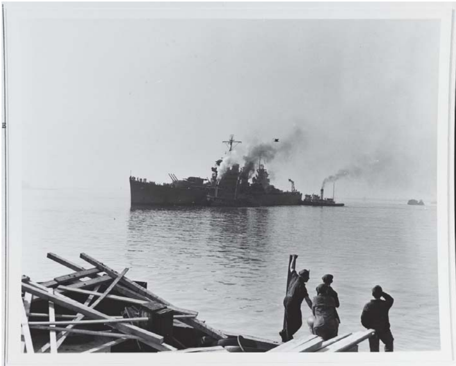
Figure 5. USS Boise (CL-47) arrives at the Philadelphia Navy Yard, Pennsylvania, for battle damage repairs, November 1942. The damage she sustained resulted in a large fire that burned out her three forward 6/47 gun turrets and their ammunition spaces. U.S. Navy Photograph, National Archive.

required to analyze lessons learned from past operations, formulate recommendations, and make doctrinal changes. This lag meant that months passed between evaluation and implementation, causing recommendations to arrive too late to affect the outcome of subsequent battles. For example, the Navy did not release its official report on the Battle of Savo Island until May 1943, nine months after the action and four months after Guadalcanal was secure. 51