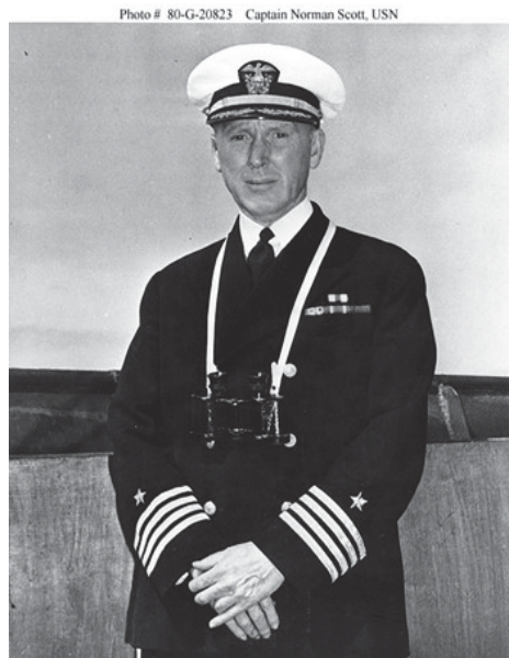
Figure 2. Rear Admiral Norman Scott.

The action also illustrated that the US Navy lacked sufficient surface warfare doctrine for light forces at night. To his credit, Scott made it up as he went along and his force generally performed very well. In his endorsement of the COMTF64.2 after-action report,