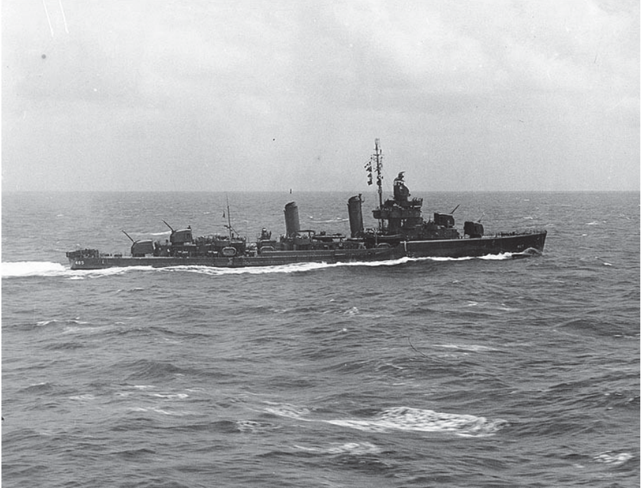
Figure 4. USS Duncan (DD-485) underway in the south Pacific on 7 October 1942, five days before she was sunk in the Battle of Cape Esperance. Photographed from USS Copahee (ACV-12).

Savo Island commanders had not. The admiral drafted a cohesive battle plan and communicated it to TF 64.2 skippers two full days before the battle. 44 Aware that crew fatigue had been a major factor in the defeat two months earlier, Scott made sure his crews had ample time to take meals and ready their battle stations before calling them to General Quarters.