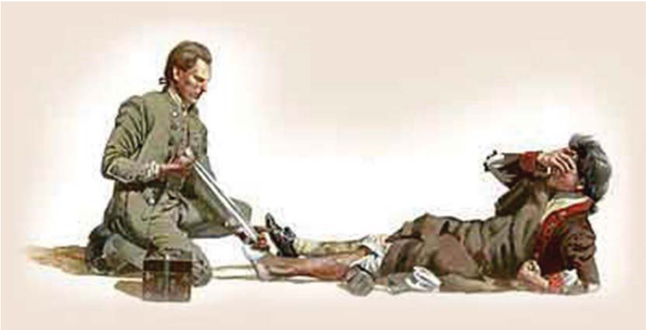
Figure 1. Revolutionary War wound care.

The Revolutionary War signals the beginning of true American history, the point at which we evolved from thirteen fledgling colonies maintaining a separate existence from one another under the watchful, restrictive eye of Great Britain into a collective force of American citizens, fighting together for independence, freedom, and autonomy. While every boy and girl learns about the American Revolution during grade school, and although aspects of the Revolutionary War permeate our daily culture from annual holidays to celebratory liquor labels, there is a lot left unexplored within the history of the Revolutionary War.