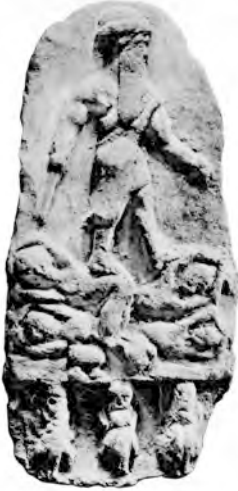
LIMESTONE PLAQUE With relief showing a king trampling on his enemies

Image in Relief. Unknown Kish king, possibly Mesilim, attacks and tramples enemies. Found near mud layer several feet beneath the ground level structures of Kish. This indicates deep antiquity. Please see special note in endnotes concerning use.