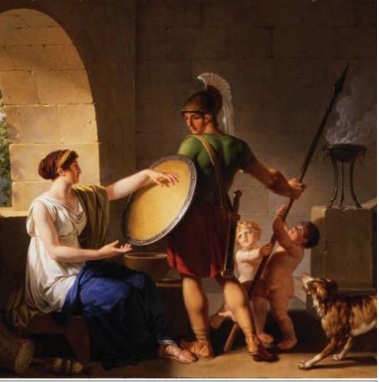
Figure 1 A Spartan Woman Giving a Shield to her Son. Oil on panel by Jean Jacques François Lebarbier, 1805. Held by the Portland Art Museum in European Art Collection.

The greater freedoms of Spartan women began at birth; families treated females just as well as male babies "It was the only Greek city in which woman was treated almost on equality with man."19 Spartans educated them much in the same way as the boys attending school and encouraged them to participate in sports. Nardo states that according to Xenophon, strong, healthy, physically active girls and women bred healthy children for the state.<sup>20</sup> Spartan women had to be almost as educated as men because they were expected to take care of their interests and